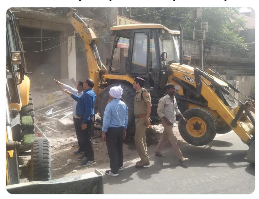
2:23 AM · Jun 11, 2022 · Twitter for Android