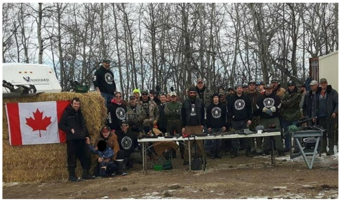
Figure above from III% Alberta Facebook Page (screenshot September 24, 2019)

In other words, to be listed, an order in council from a cabinet minister must be made to "prohibit assemblies" for the listed purposes. Considering that the Three Percenters engage in "drilling and training in the use of arms," section 70 is a very clear avenue by which the federal government could prohibit their assembly and activities as such.